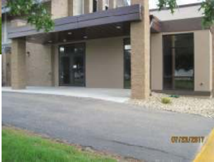
View of portico and front door on north side of building.