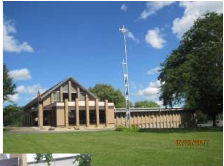
View of entire front of building.