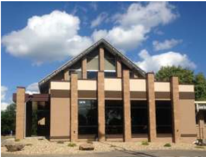
Landscaping at front of building, in front of Gathering Room.