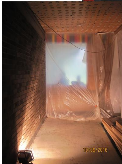
Left: Hallway to elevator (used to be the north end of the nursery)