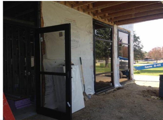
Above: Doors and windows of new gathering space addition.